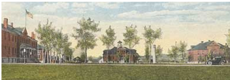
Operated from 1898 to 1933 when it became a Sanitarium for the treatment of tuberculosis for the Lakota. Rapid City, SD